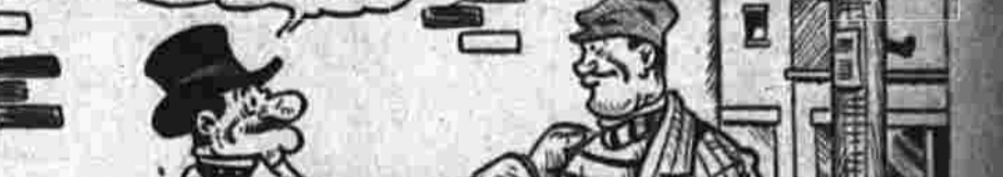
WELL, SHE'D SAY BY EDGAR MARTIN