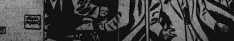
SCORCHY SMITH 'Tis Better To Give . . . BY JOHN C. TERRY