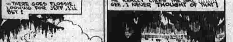
FUNNY BUSINESS BY ROY CRANE