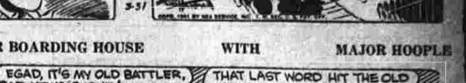
THAT LAST WORD WITH MAJOR HOOPLE