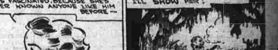
WELL, SHE'D SAY BY EDGAR MARTIN