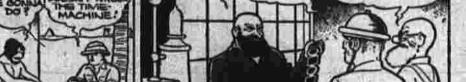
TOONVILLE BY FONTAINE FOX