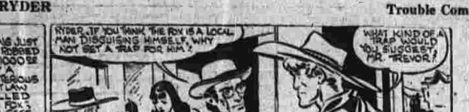
RED RYDER Trouble Coming Up BY FRED HARMAN

Curb Stocks When perturbations were displayed in the orbit of the planet Uranus, two astronomers, working without each other's knowledge, arrived at the conclusion that an unknown planet was in the neighborhood.