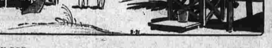
ALLEY OOP BY V. T. HAMLIN